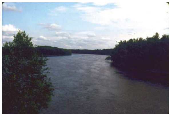
Figure 1 – A Natural Watercourse With A Defined Bed, Banks and Sufficient Flow

Almost the whole definition of a natural watercourse is founded on the saying aqua currit et debet currere , or “water flows naturally and should be permitted thus to flow”. A natural watercourse is defined generally as “a stream of water which flows along a defined channel, with a bed and banks, for a sufficient time to give it substantial existence”. See Figure 1. It must, on casual examination, “present the unmistakable evidence of the frequent action of running water”. It is not essential that the supply be continuous, or form a perennial living source for flora or fauna. It is enough if “the water rises periodically from natural causes and reaches a plainly defined channel of a permanent character”. One can usually identify a natural watercourse on an aerial photo or a topographic map. See Figure 2. A natural watercourse “does not cease to be such if at a certain point it spreads out over a level area and flows for a distance without defined banks before flowing again in a defined channel”. Often, it is “the valley through which the stream runs, and not its low level or low water channel, which is the water course”. If water is in a natural watercourse , it must be permitted to flow.