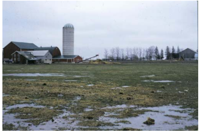
Figure 4 – Surface Water Has No Defined Course And No Right Of Drainage

Surface water has no defined course. See Figure 4. It is "the water that falls as precipitation, but which finds its way to a natural watercourse by percolation or flow". Common Law can be confusing when it comes to surface water because, under most circumstances, it has no right of drainage and the law appears to deny the right of water to flow downhill. This is described further in this Factsheet.