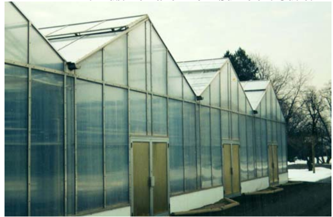
Figure 5 – Surface Water Drained Off Greenhouse Roofs Has Been Collected Into Eavestroughs, So It Must Be Taken To A Sufficient Outlet

collected in catch basins, or runoff from parking lots and yard areas. The same answer applies as previously indicated.