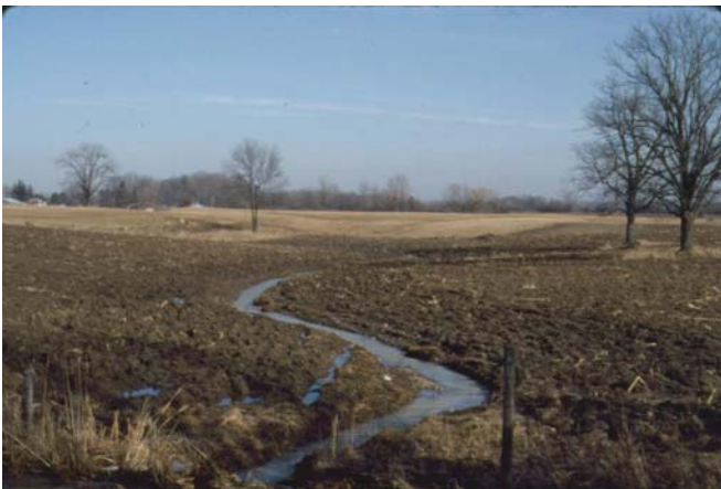
Figure 3 – A Private Ditch Or Channel Across A Low Area Is Not Usually Considered To Be A Natural Watercourse

Farmers, and others, often have their own ideas about what is or isn't a natural watercourse . Obvious examples of natural watercourses in Ontario include: the St. Lawrence River, the Niagara River, and the Grand River. Many creeks and streams might also be considered to be natural watercourses . However, private ditches and channels across low areas on one's own property are not usually considered to be natural watercourses . See Figure 3. The courts have the final say on whether a channel is a natural watercourse or not. Everyone else can only offer an opinion.