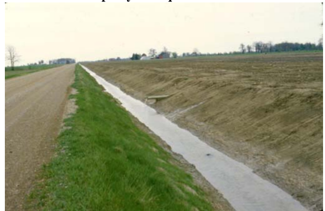
Figure 6 – Municipalities Are Not Obligated To Dig Their Road Ditches Deep Enough To Outlet Tile Drains, Although These Ditches Often Provide Excellent Outlets. Permission From The Municipality Is Required.

The road department is not required to dig their ditches deep enough to provide outlet for tile drains. See Figure 6. Road ditches are just another form of private ditch, and the road authorities are only obligated to dig their ditches deep enough to handle the surface water off their own roads. They are not even required to take surface water from surrounding land. There is no right of drainage of surface water even if it is in a road ditch, unless the ditch is part of a Municipal Drain and access for tile drains is permitted. That is, an owner of lower land can block the passage of ditches that are not natural watercourses or part of a Municipal Drain . For normal road ditches, permission must be obtained from the road department to outlet tile drains into them.